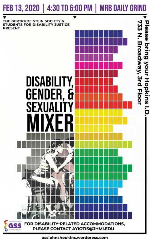
Flyer for Disability, Gender, and Sexuality Mixer

The Diversity Innovation Grant supported food and drinks for a mixer co-sponsored by the Gertrude Stein Society, which is the LGBTQ+ organization for the East Baltimore campus. About fifteen people attended the mixer, which connected students from the Gertrude Stein Society with students interested in disability issues.