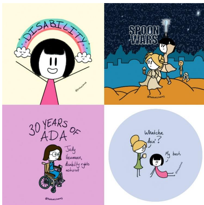
Four 1.75" button designs drawn by a disabled artist, PotsieSpoons