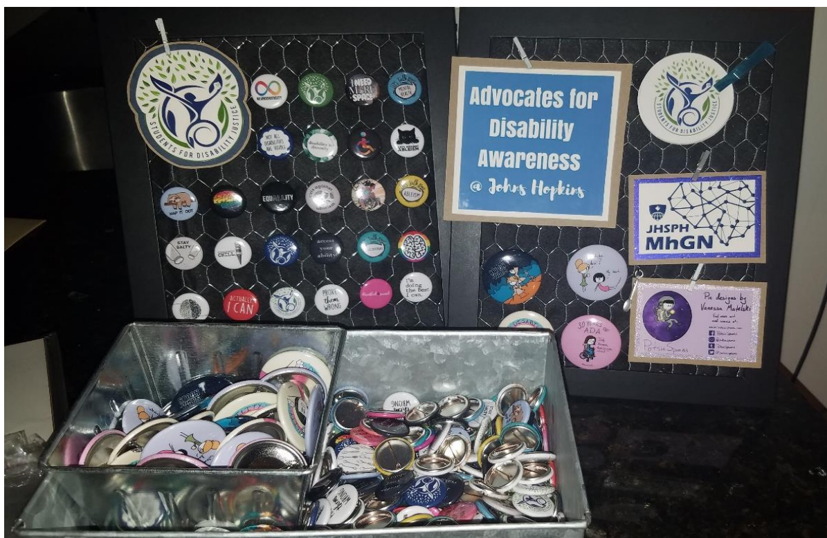
Button and sticker display for Students for Disability Justice events