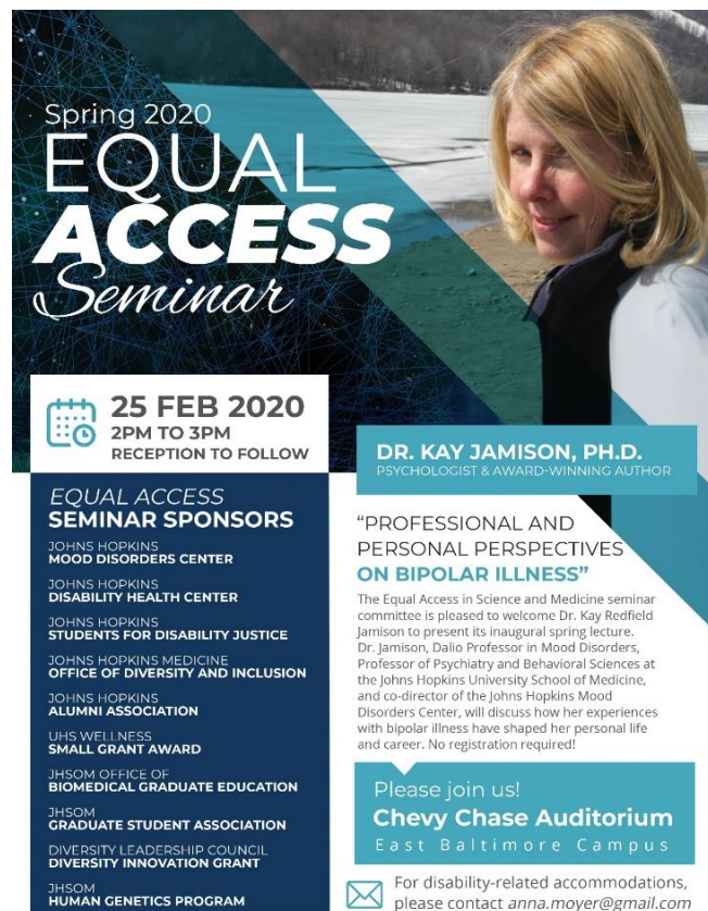
Flyer for Equal Access seminar

We worked with the Equal Access in Science and Medicine committee to organize the first seminar of this new lecture series, which aims to highlight the perspectives of scientists and clinicians with disabilities, chronic illnesses, and mental health conditions. Dr. Kay Jamison delivered a lecture titled, "Professional and Personal Perspectives on Bipolar Illness" and more than 150 people attended from Johns Hopkins and from the Baltimore community.