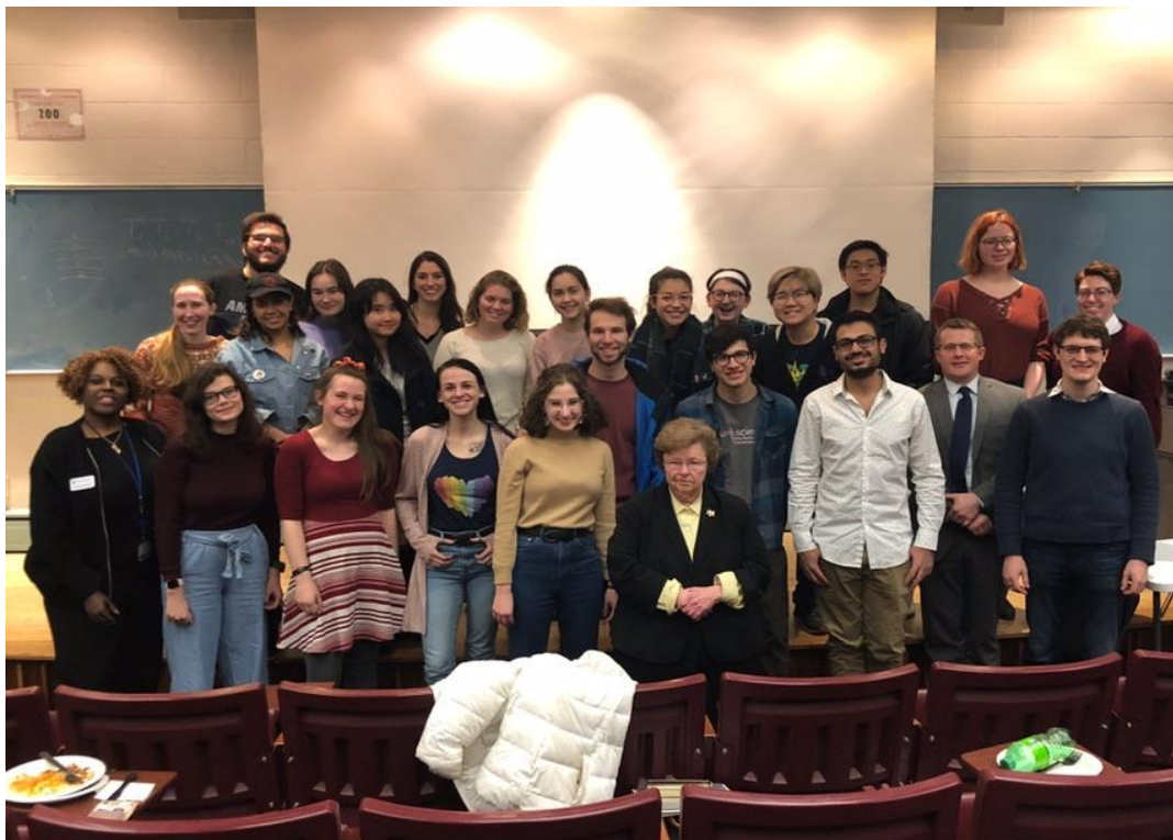
Attendees at Q&A Session with Senator Mikulski