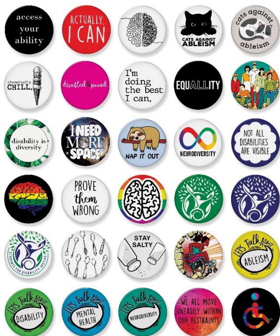
Thirty one-inch button designs