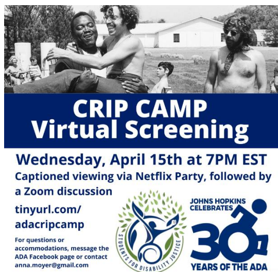
Social media image for Crip Camp Virtual Screening

In response to the cancellation of all in-person events, Students for Disability Justice and the Advocates for Disability Awareness student group collaborated to host an online screening and discussion of the film Crip Camp . The film follows disability rights activists from a camp for teens with disabilities through the creation of the Americans with Disabilities Act. The number of people who watched the film is unknown due to technical limitations, but five people joined the discussion following the film.