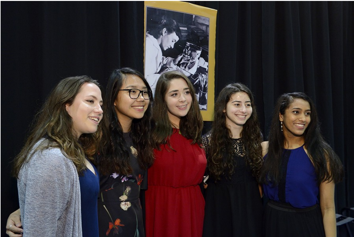
The portraits added to High Table include: (1) Madeleine Albright - First female Secretary of State.